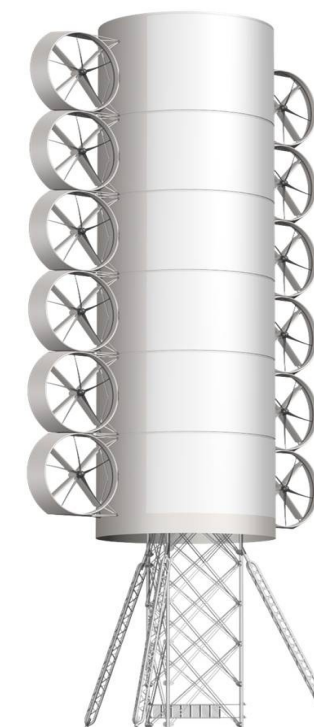
This is an illustration of the wind turbine that will be built for our school. Once operational, our district will generate between 1/2 and 2/3 of its electricity from green energy sources.

Visit www.optiwind.com and watch video of the Klug Farm turbine, which is similar to the one that will be installed just off campus in December, 2012.